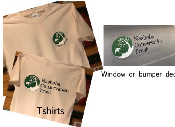
Window or bumper decals

NCT T-shirts. Sizes S-M-L-XL-XXL. $20 ea