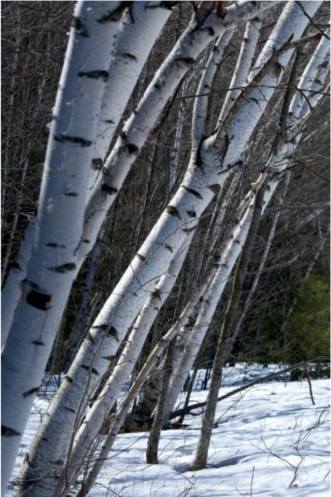
Birches at Heald Orchard