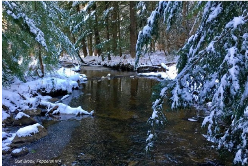
Winter beauty at Gulf Brook in Pepperell