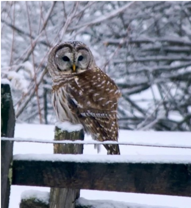
Barred Owl in Winter Plumage

A total of 73 species of birds were found within the circle including two species new to the count: House Wren and American Widgeon. We had high counts for 11 species: Coopers Hawk (15), Great Horned Owl (13), Barred Owl (13), Yellow-bellied Sapsucker (1, tied previous record), Northern Flicker (20), American Crow (779), Hermit Thrush (6), Pine Warbler (1, tied previous record), and Swamp Sparrow (8). In total, over 8400 birds were counted, a great many within Pepperell and by dedicated Pepperell residents.