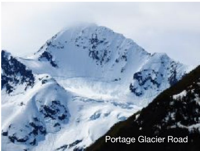
Portage Glacier Road