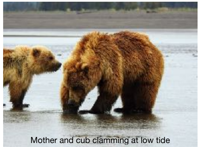
Mother and cub clamming at low tide

and took in the breathtaking snowcapped mountains and glaciers looming all around us. Far above us, we watched a black bear crossing a meadow with her cub and mountain goats perching on the edges of cliffs as they browsed for food. Using our Kenai Peninsula Wildlife Guide, we hiked many trails carrying bear spray with us as a precaution. We added more bird species to our list with each walk, including many we had never seen before. When we were climbing a trail along a moving stream with waterfalls, we saw an American Dipper. By the end of our trip we had seen nearly 100 bird species. We saw moose browsing just about every day. We watched a female moose browsing across the river from where we were staying in Soldotna, while her two calves played along the water's edge. Further down the river was another female moose with one calf, and we saw Caribou in a nearby location who were well hidden.