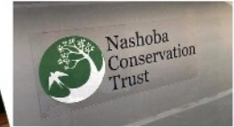
Window or bumper decals

Window or Bumper decal 3" X 6" $5.00 ea.